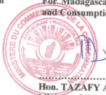
..... Hon. TAZAFY Armand Minister of Commerce and Consumption

For Madagascar Ministry of Commerce and Consumption